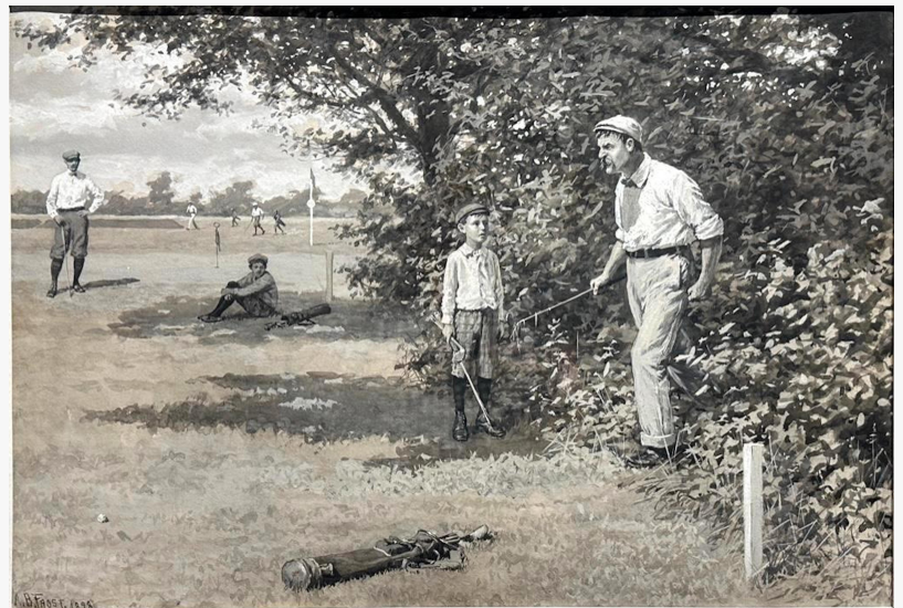
Gouache on paper painting by Arthur Burdette Frost (American, 1851-1928), titled "I've Played Thirteen!" (1898), signed and dated, 17 inches by 25 inches (less frame) (est. $30,000-$40,000).