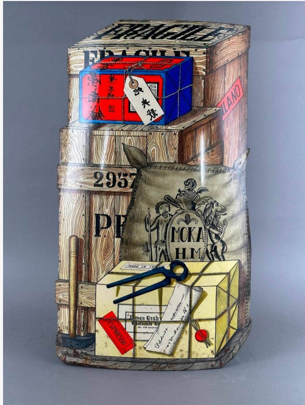
Lithographed toile umbrella stand by Piero Fornasetti (Milan, Italy, 1913-1988), titled "Import-Export", decorated with various shipping parcels and packages with tools (est. $800-$1,200).