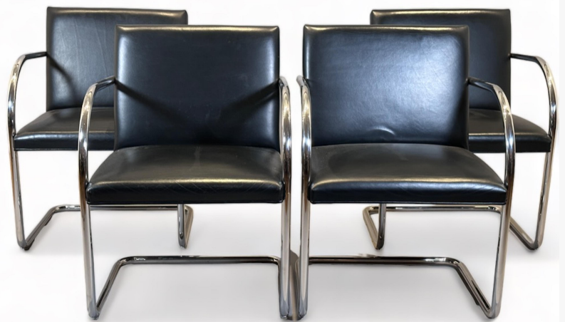
Four Brueton tubular chromed steel and leather armchairs, with square upholstered backs and seats on tubular chromed steel cantilevered bases, bearing Brueton tags (est. $800-$1,200).

and an oil on canvas by Edouard Joseph Dantan (French, 1848-1897), titled