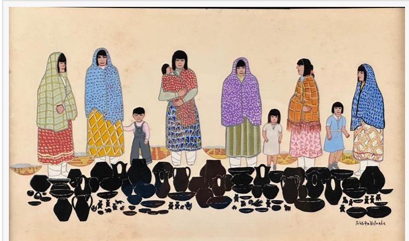
Paintings by the Pueblo artist Pablita Velarde (born Tse Tsan, 1918-2006) include this acrylic on paper titled "Santa Clara Women and Children Selling Ceramic Wares" (est. $800-$1,200).

BEACHWOOD, OH, UNITED STATES, October 13, 2023 /EINPresswire.com/ -- Wonderful creations by the Italian artist and designer Piero Fornasetti , pieces produced for the New York-based furniture manufacturer Brueton , paintings by American Pueblo artist Pablita Velarde and more will come up for bid in a Fine Art & Luxury Décor auction slated for Saturday, October 28th, by Neue Auctions, starting at 10 am Eastern time.