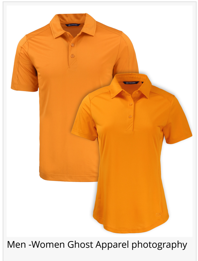
Men -Women Ghost Apparel photography

Proper Lighting: Use consistent and well-distributed lighting to highlight the jewelry's features and minimize shadows. Soft, diffused lighting is often used for jewelry photography.