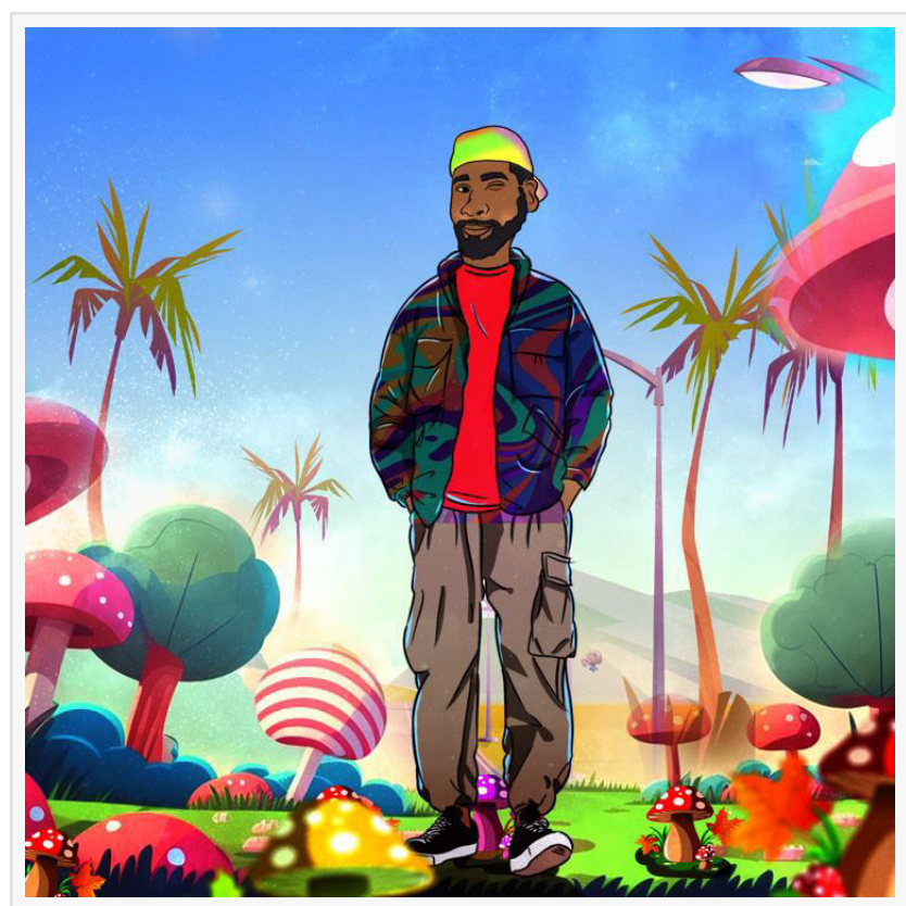
Dump That album cover