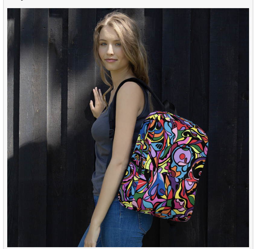
Foogazi paint backpack