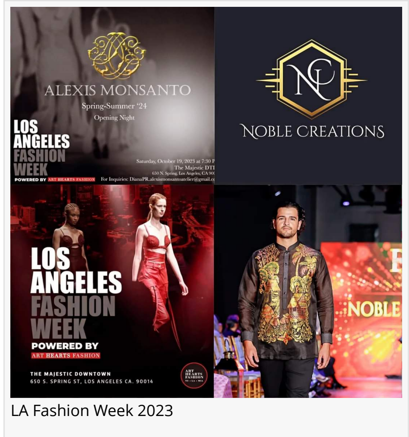
LA Fashion Week 2023

Had a great time at DFS. Always have this feeling that we're family in there supporting each other in each of our fields. It is a well-planned out event and just a smooth sailing production for designers and models alike. So thankful that get to have that chance again to showcase our product representing the Philippines.