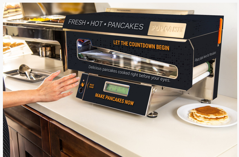
1 Star Pop cake