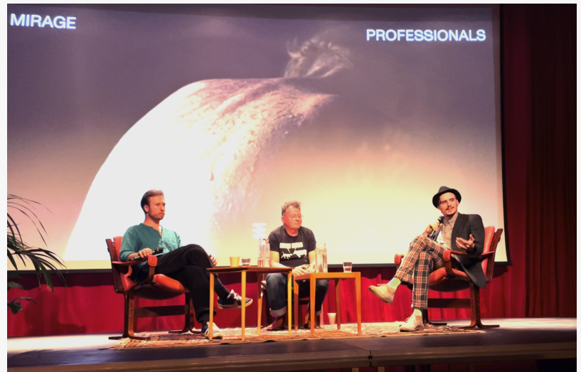
Talk: the performative element of cinema (Mirage Film Festival)