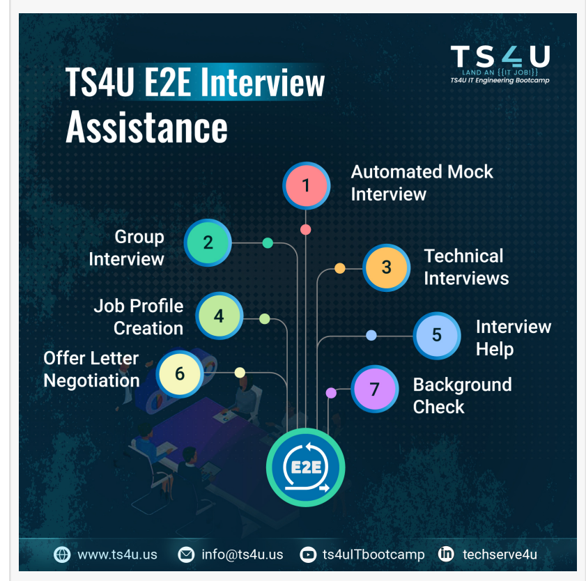
TS4U E2E Interview Journey

make education more accessible through efficient processes and versatile payment options like: