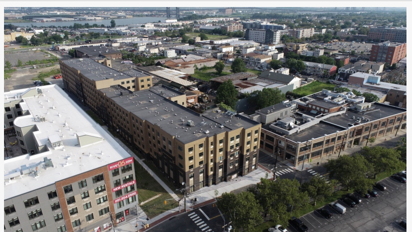
NJCU West Campus

Enterprises ("CanAm") is delighted to announce the full repayment of its 51st EB-5 project, which is a two-building housing complex on the West Campus of New Jersey City University ("NJCU"). This repayment is the 51st in CanAm's history and brings CanAm's total EB-5 capital repayments to $2.26 billion.