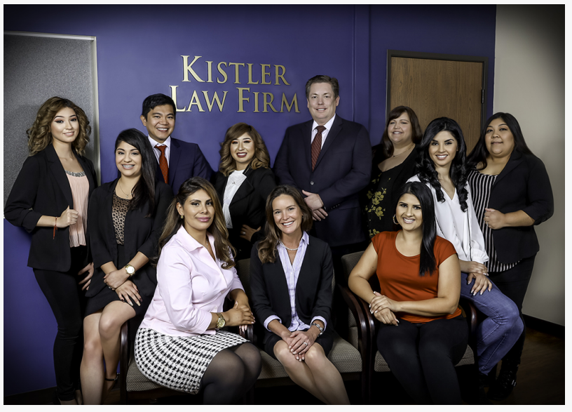
Palmdale Personal Injury Law Firm