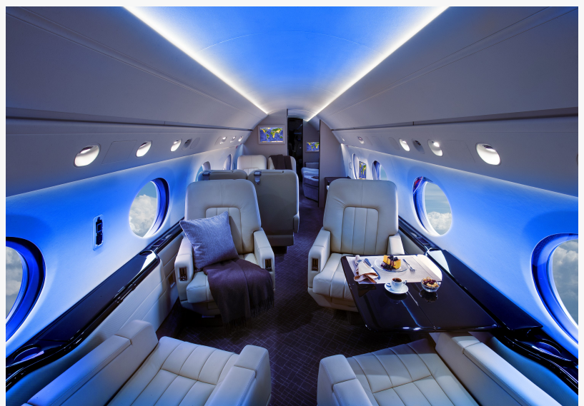
Trans-Exec Private Jets

LOS ANGELES, CA, USA, October 17, 2023 /EINPresswire.com/ -- Trans-Exec Private Jets ( transexec.com ), an industry leader in private charter aviation, proudly announces its commitment to elevating the passenger experience with the introduction of Starlink high-speed, low-latency connectivity throughout its entire fleet of aircraft. This strategic integration accentuates Trans-Exec's pioneering role in embracing cutting-edge technology and reinforces the company's reputation of providing its members and guests with an unparalleled private jet experience.