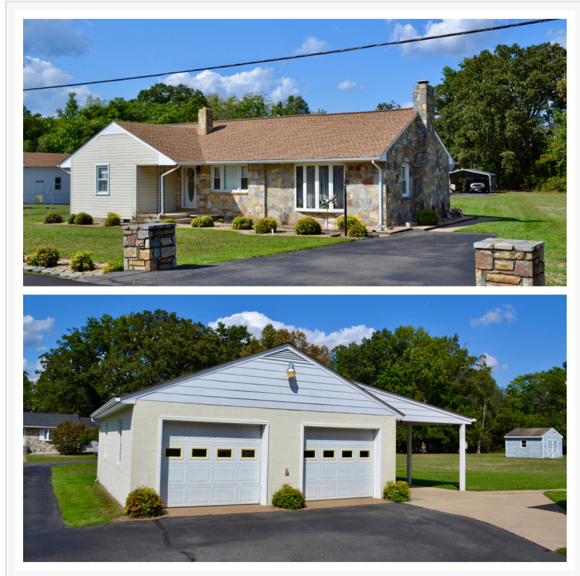
118 Musselman Rd., Fredericksburg, VA 22405

"This well located home has been lovingly occupied by the original owners/builders since 1958 and they