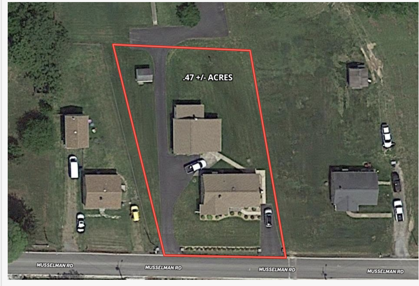
118 Musselman Rd., Fredericksburg, VA 22405