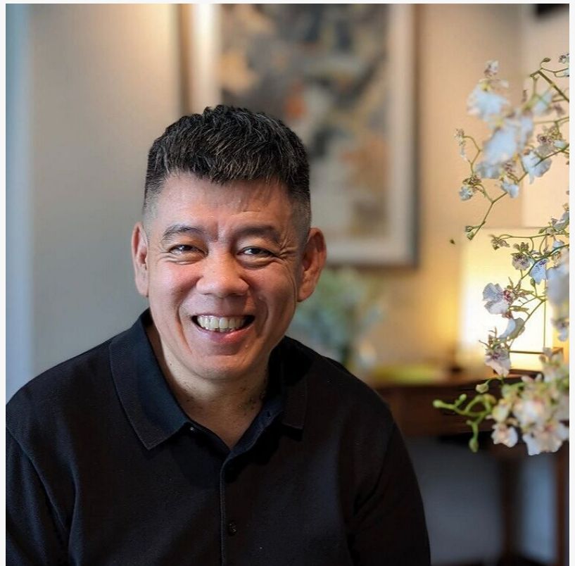
Author Terence Ang