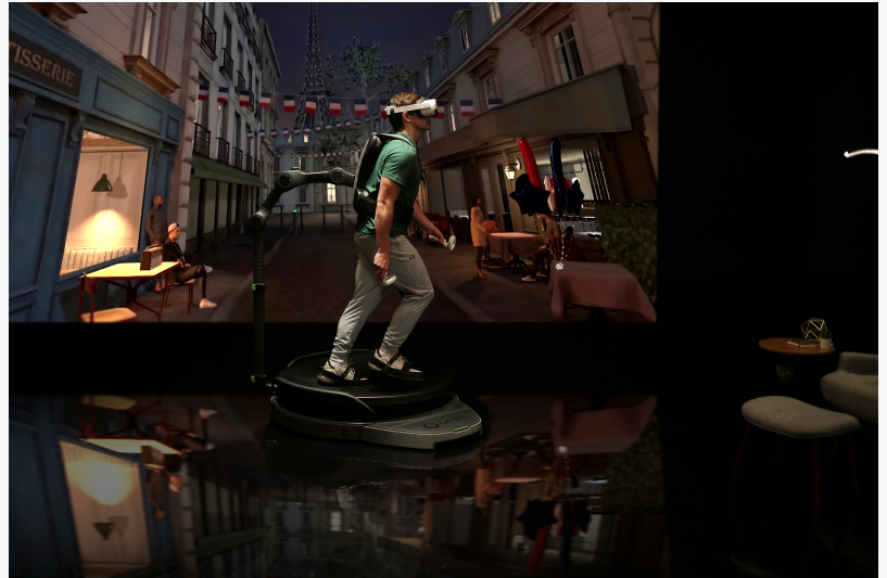
An Omni One player explores the streets of Paris.

Earlier this year, Virtuix raised over $11 million in a Series B investment round led by JC Team Capital and Pinto Capital Investments. The round also included an equity crowdfunding