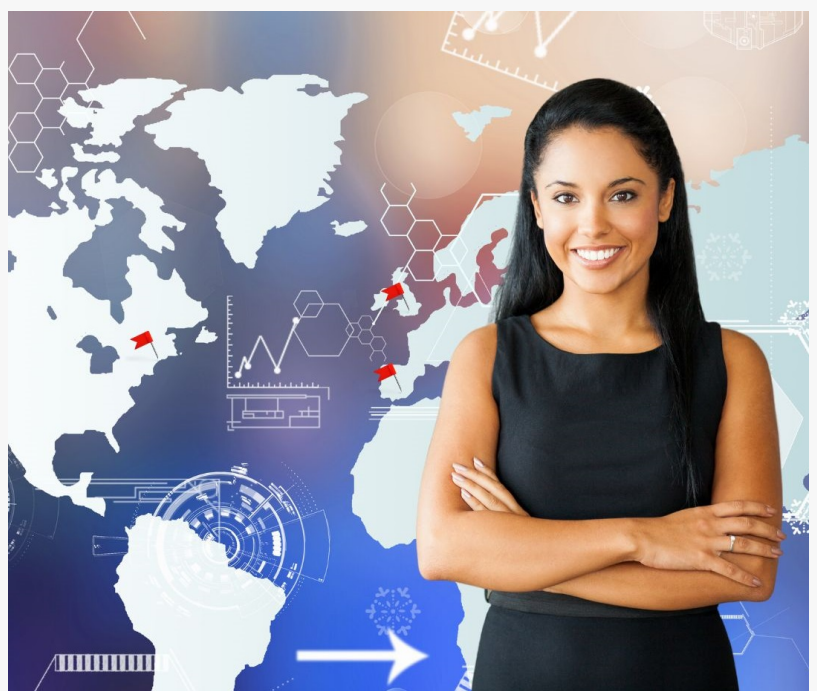
American Consumer Claims in the US European Consumer Claims in Europe

American Consumer Claims (ACC) might be a relatively new name in the USA, but they have been timeshare claims and relinquishment market leaders in Europe since 2016. Across the Atlantic they are known as European Consumer Claims (ECC), and have helped thousands of people escape from unfair and unwanted timeshare contracts. They have also successfully claimed tens of millions of pounds in financial compensation for clients who were mis-sold memberships.