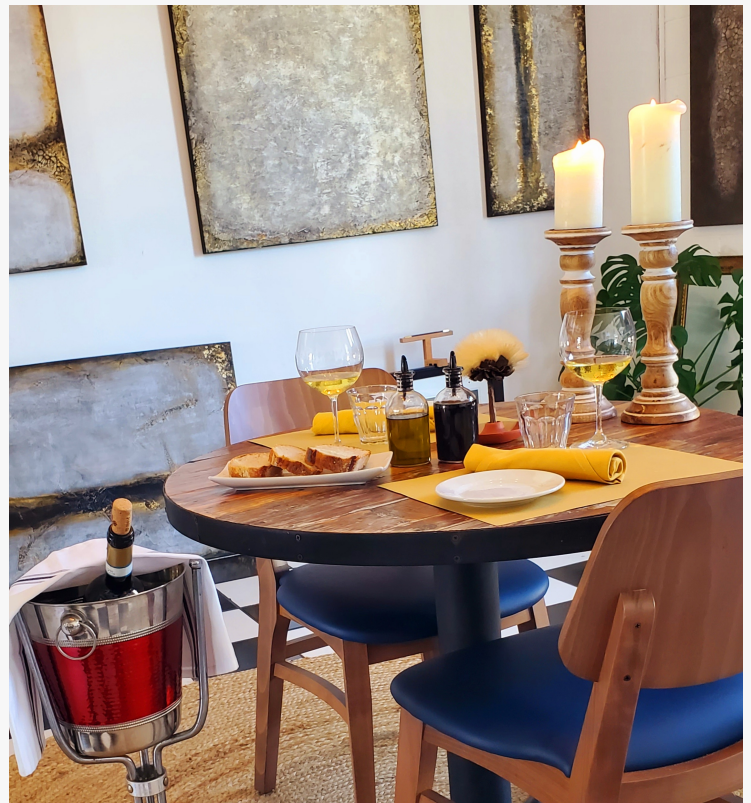
Martiradonna Fine Art Studio