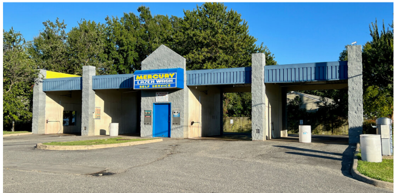
4117 W. Mercury Blvd., Hampton, VA 23666