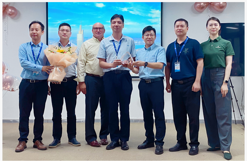
Segue Manufacturing Services Honored with Emerson Supplier Award for Outstanding Overall Support