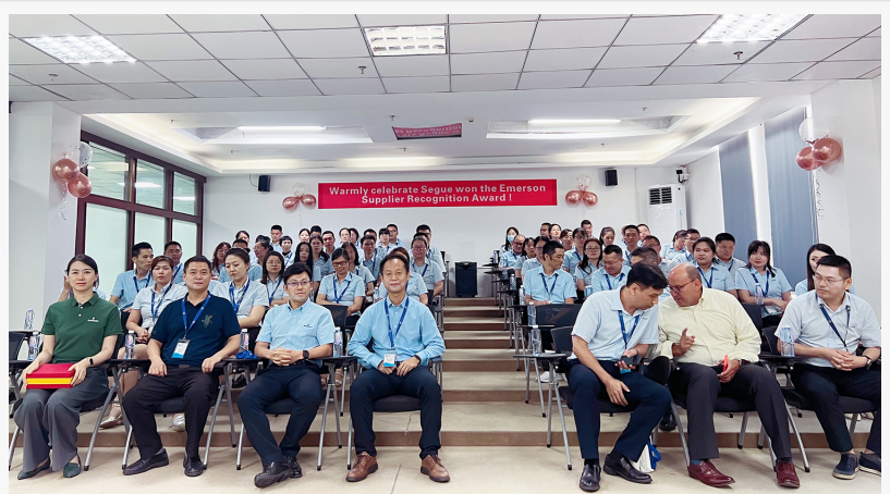
Segue Manufacturing Services Team in Xiamen, China, Honored by Emerson Award

engineering services for the Medical, Industrial and Industrial Automation, Capital Equipment and Tier I EMS markets. Part of the Lorom group of companies, Segue is known for its seamless product transfer services for complex electronic products, with highly skilled engineering and manufacturing experts in NPI and launch, low-to-medium volume production, full-scale manufacturing and worldwide distribution. For more information, visit www.segue-mfg.com