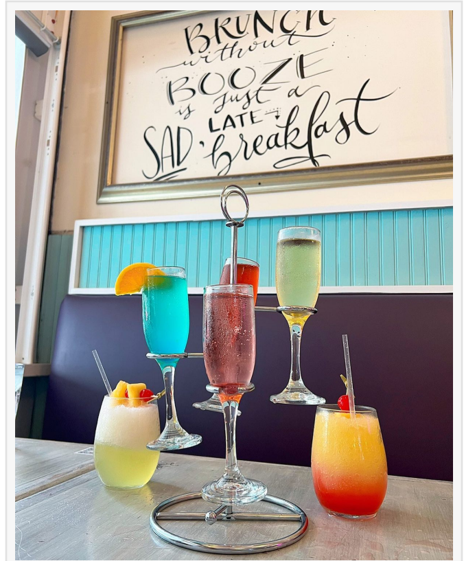
4 Mimosas in our Mimosa Flight & 2 Cocktails

Tom Claxton Influx Marketing +1 312-391-1446 email us here Visit us on social media: Facebook Twitter Instagram Other