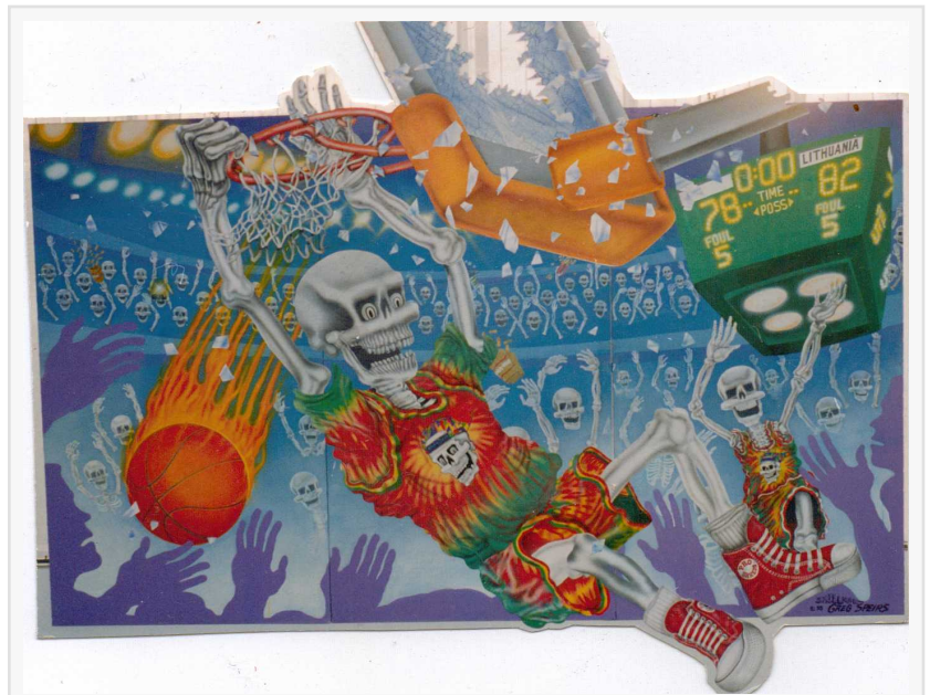
Original Lithuania Tie Dyed Slam-Dunking Skullman Trademark and Brand eshrined in the Basketball Hall of Fame in Springfield, Massachusetts.