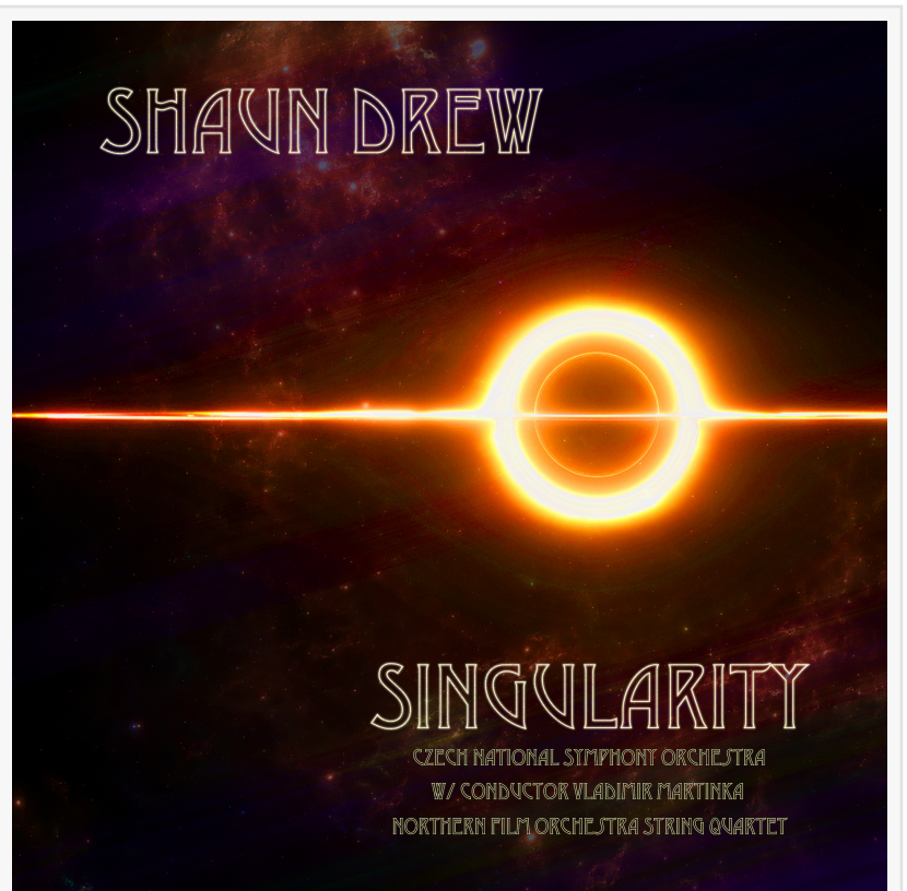
Shaun Drew explores the future of music with "Singularity"

This press release can be viewed online at: https://www.einpresswire.com/article/662517099