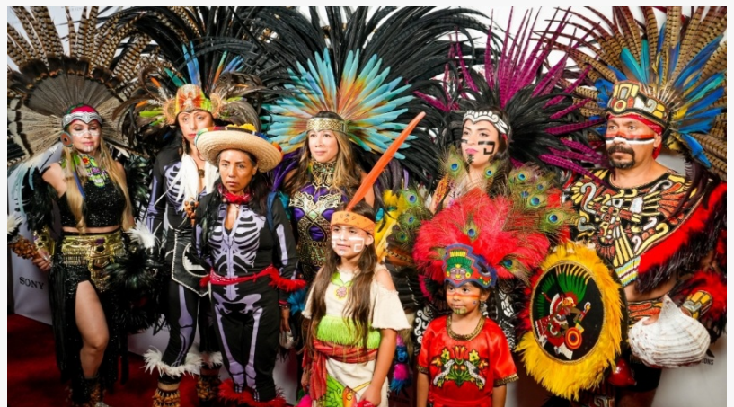
Xipe Tote (Team)