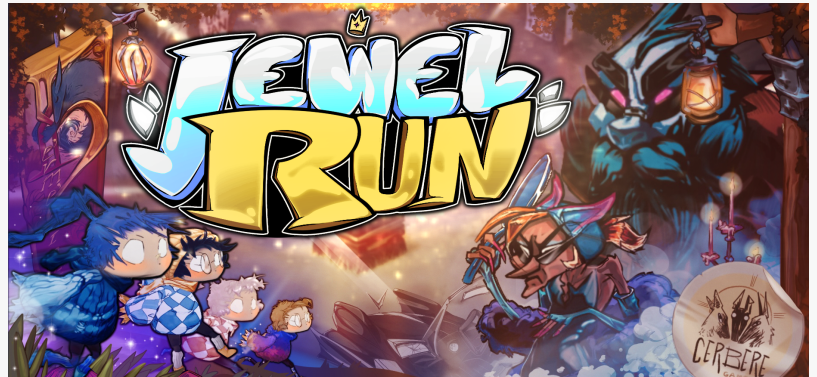
Jewel Run Library Art

PARIS, ILE DE FRANCE, FRANCE, October 18, 2023 /EINPresswire.com/ -- Cerbere Games is proud to announce that Jewel Run, their free-to-play online multiplayer game of fun burglary, will be released October 20, 2023 on mobile phones, PC, Mac and Steam Deck. In Jewel Run, join the heist as two teams with distinct gameplay styles go head-to-head: Will the cunning thieves outsmart the magical orchard's vigilant guards, or will the guardians protect their treasures?