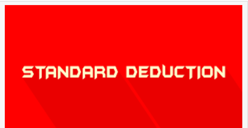
Standard Deduction Amount

Heads of Household: Heads of household can also anticipate a noteworthy increase in their standard deduction for 2024, a valuable change for single parents and those who financially