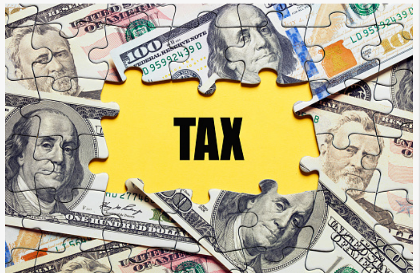
Standard Deduction Married Filing Jointly