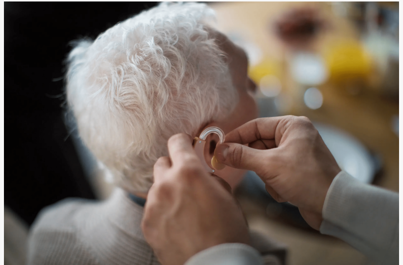
Hearing Health Solutions takes pride in their professional hearing aid services

Hearing Health Solutions wants to ensure Columbus residents are informed about the differences between prescription and over-the-counter hearing aids . Prescription hearing aids are programmed by professionals based on a patient's individual hearing loss, while over-the-counter hearing aids offer generic programming with minimal fine-tuning options. Prescription hearing devices can treat more severe hearing loss than OTC devices, and there are required policies related to the availability of device returns. Research shows that patients report higher user satisfaction when they work with professionals for their hearing needs, with either prescription or OTC devices.