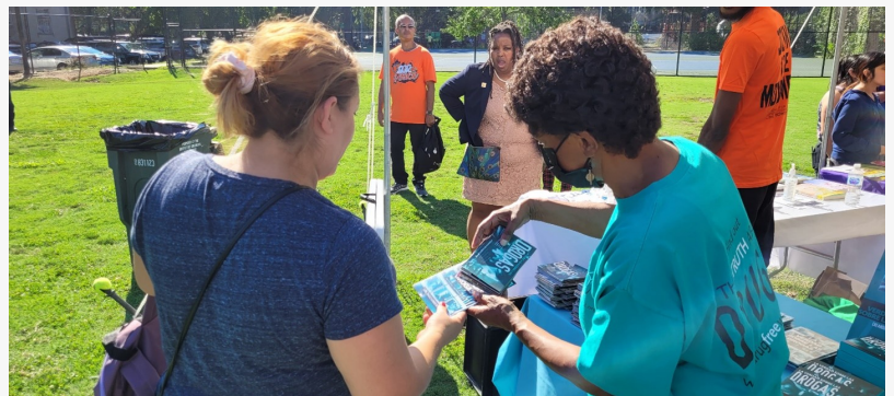
A Drug-Free World volunteer showing a mother information from a DFW booklet giving details about specific drugs