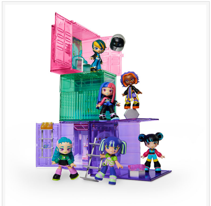
Squadz Place Tokyo Trends Doll Line