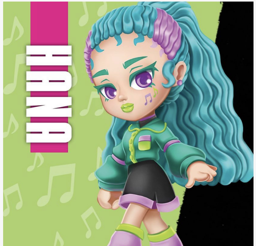
Squadz Place Tokyo Trends Doll Line Featuring Hana