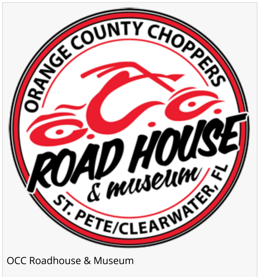
OCC Roadhouse & Museum