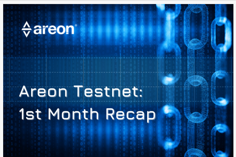
Areon Testnet, First Month Recap