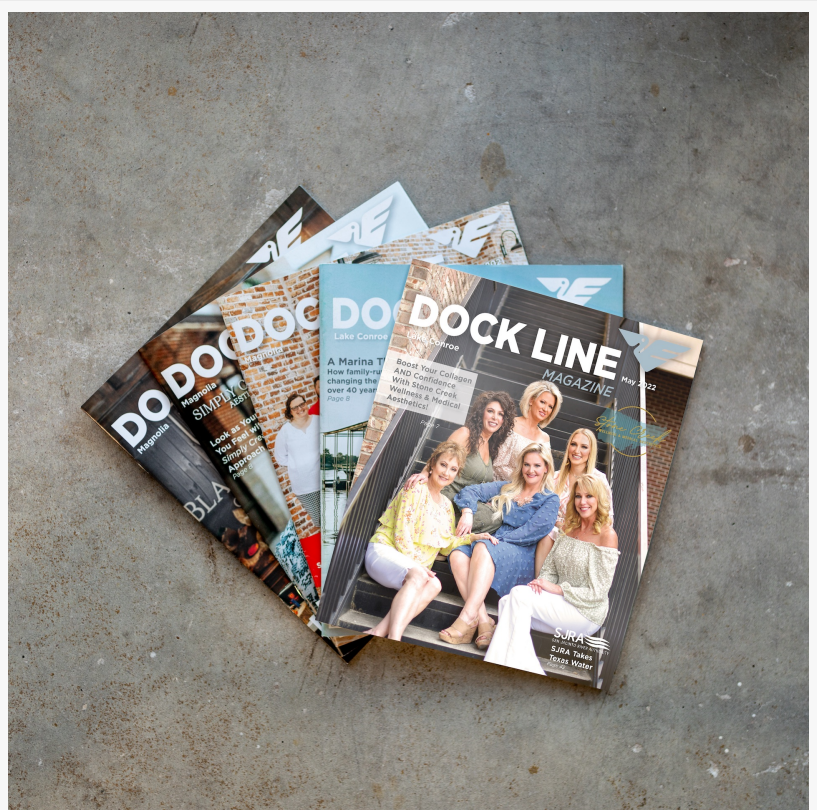
Dock Line Magazine Texas

Dock Line Magazine, with its significant readership of over 122,000 monthly local patrons and over half a million national monthly readers both online and by mail, has consistently showcased the essence of Texas communities, spotlighting areas such as The Woodlands , Conroe , Huntsville, Tomball, Magnolia, and New Braunfels. This promotion presents