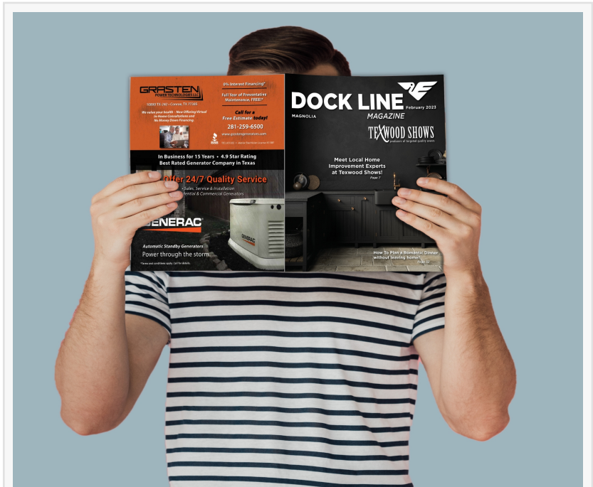
Dock Line Magazine