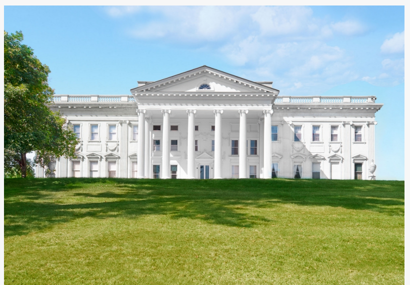
Private behind the scenes tour for two with champagne at Mills Mansion, Staatsburgh, NY.

By participating in this auction, you directly support DCHS's century-old mission to collect, preserve, interpret, and share the history of Dutchess County, spanning from the arrival of the first indigenous peoples to the present day. View the DCHS Autumn Auction Catalog: Auction