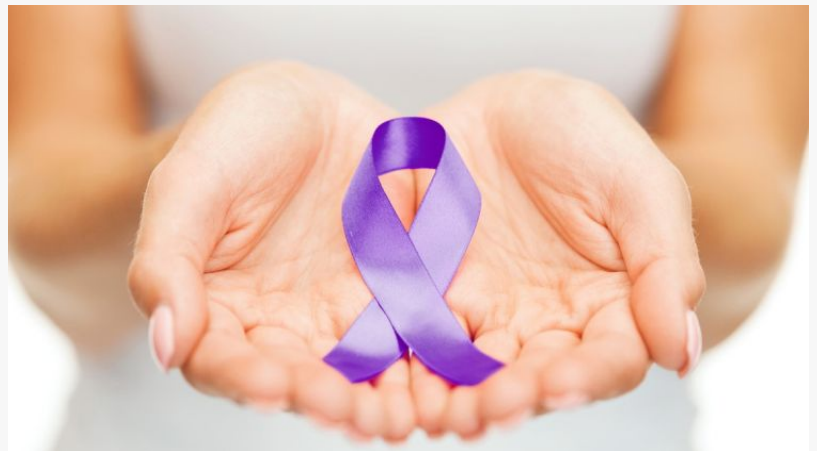
End Domestic Violence