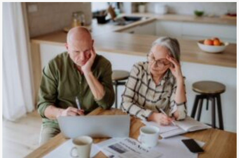
Electricity Deposit Waiver Program