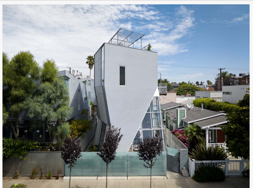
513 Grand Boulevard | Venice, CA

buyers to bid digitally from anywhere in the world. Starting bids are expected between $1 million to $3 million.