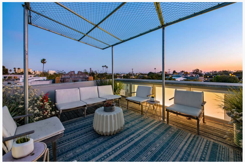
Stunning rooftop deck for entertaining with an ocean breeze

Emily Roberts Concierge Auctions +1 212-202-2940 email us here