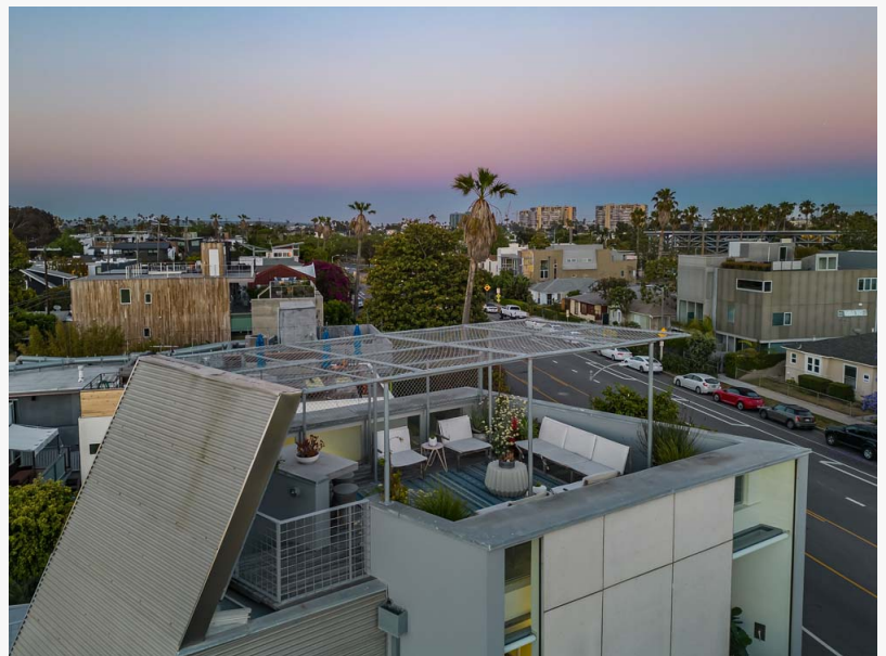
Ideal location steps from Venice Beach and Abbot Kinney Blvd

This press release can be viewed online at: https://www.einpresswire.com/article/662951449