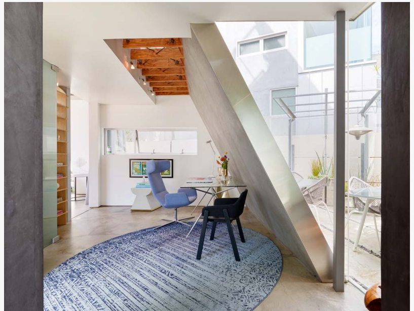
Bulthaup kitchen with premier fixtures and appliances