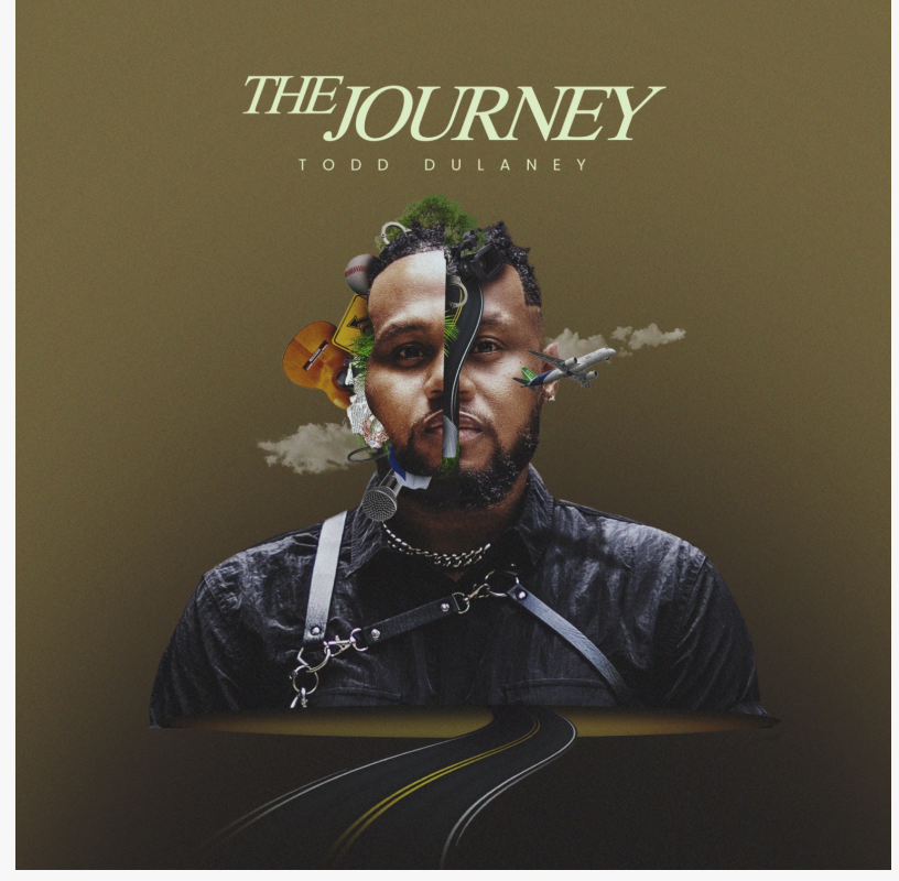
New Cover Art for Todd Dulaney's EP "The Journey"

For press interviews and features or brand collaboration inquiries, contact