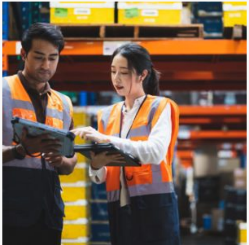
Dangerous goods transporters must follow guidelines carefully

LONDON, UK, October 20, 2023 /EINPresswire.com/ -- As an employee responsible for handling and transporting hazardous materials, compliance with regulations is critical to ensuring safe operations. Proper training prepares individuals to identify risks, follow procedures, and respond in dangerous situations. Companies shipping dangerous goods must provide accredited training to staff to meet the strict standards set by the Civil Aviation Authority (CAA) and the International Air Transport Association (IATA). Dangerous Goods Online Training offers the only online courses accredited by both the CAA and IATA to cover all aspects of transporting hazardous materials by land, sea or air. Their training program prepares participants to handle any situation and follow the law to safely transport even the most dangerous goods. With responsibility comes accountability, and these vital courses give employees the knowledge and skills to meet high standards for safety.