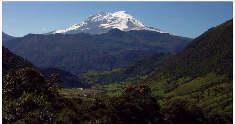
Thanks to their privileged location between the Cayambe and Antisana volcanoes, their hydro-thermal wealth is unique, creating a perfect environment in the pools