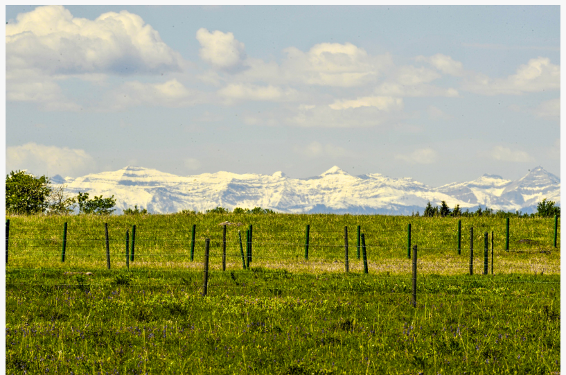
View of the Rocky Mountains from Property

President of the Future of Real Estate explains how an online auction platform can be successful. "People may question why such a valuable property, introduced to the public for the first time, is on the auction block. For hundreds of years auctions have been the primary vehicle to sell the world's most priceless artifacts. Auctions allow buyers to pay what the property is worth to them, providing a true appraisal of the property's value."