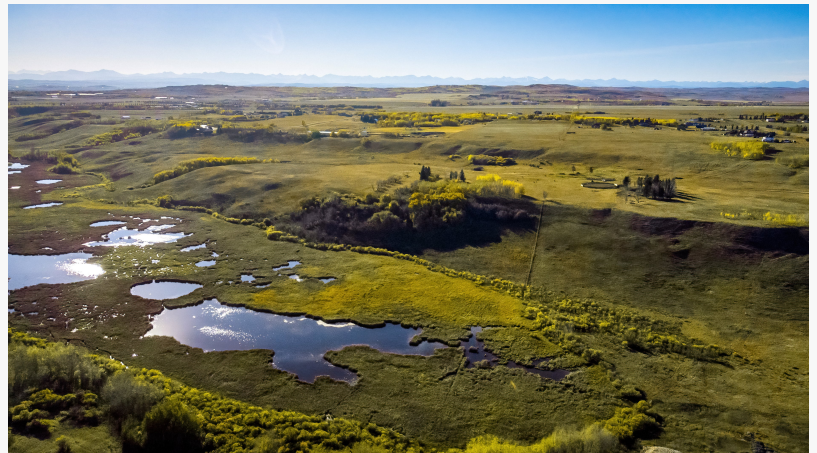
Drone Footage of Property from Bottom of the Valley