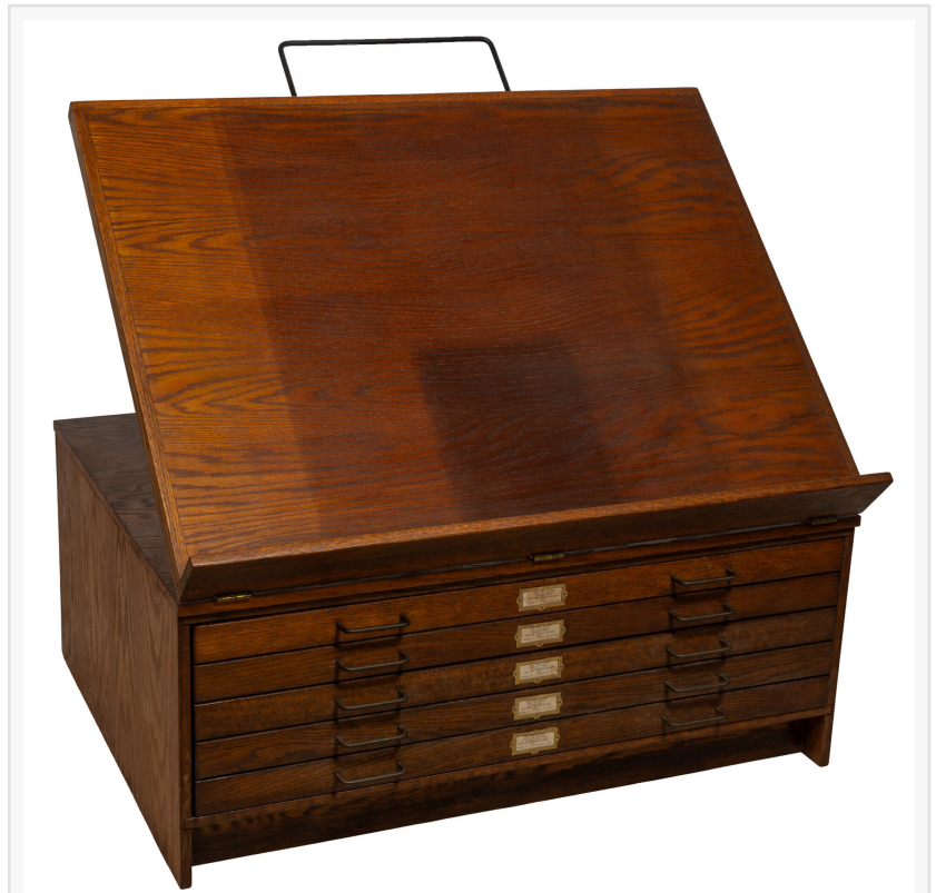
Limited-edition, full-size facsimile of John James Audubon's (1785-1851) The Birds of America (1985), with full-color reproductions by the National Audubon Society (est. $5,000-$10,000).