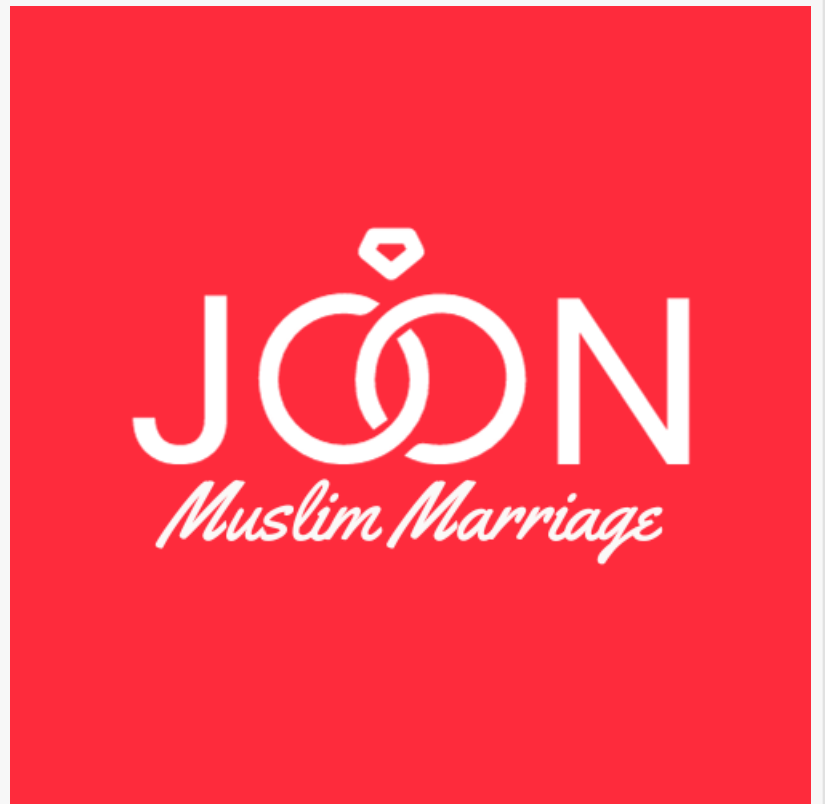
Joon Muslim Marriage App

"We believe that finding love should be an enjoyable and fulfilling experience," added the