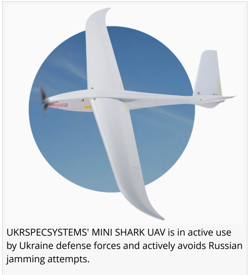
UKRSPECSYSTEMS' MINI SHARK UAV is in active use by Ukraine defense forces and actively avoids Russian jamming attempts.

The Helix Mesh Rider Radio by Doodle Labs employs state-of-the-art patented multi-band wireless technology, enabling secure and reliable communication in the face of jamming attempts. Its advanced mesh networking capabilities ensure seamless connectivity, even in