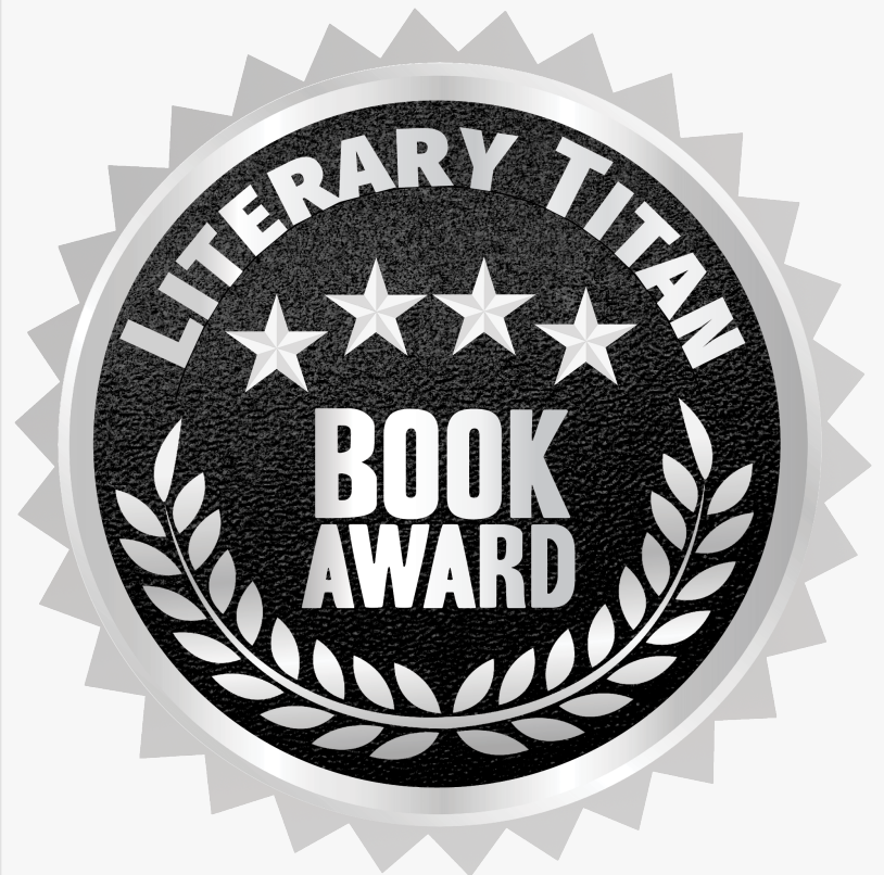
Literary Titan presented the work with a Silver Book Award