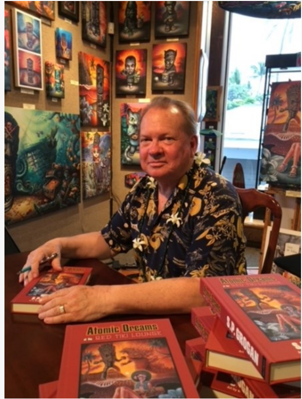
Author SP Grogan

Recent national headlines include: "FBI urges public to 'remain vigilant', cities on alert amid global calls for pro-Hamas action." And last Thursday, The U.S. Department of State issued a rare "Worldwide Caution" alert urging any American who is overseas to "exercise increased caution" due to "increased tensions in various locations around the world. The U.S.