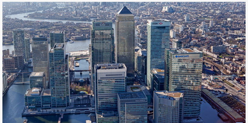
Canary Wharf - London