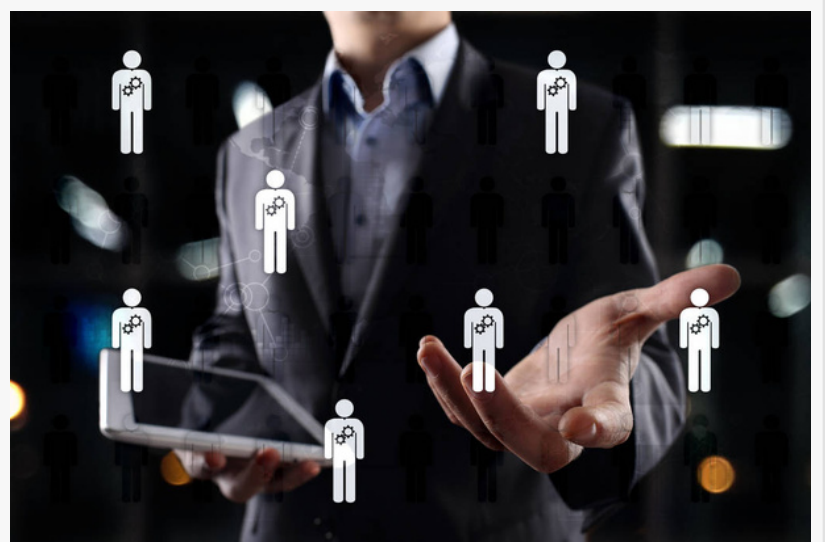
AsiaEurope Jobs All-Inclusive Subscription

The very affordable cost of the AsiaEurope Jobs All-Inclusive Subscription makes it possible for any company, regardless of size, to have access to a diverse, qualified, and experienced resource base. This accessibility opens up new horizons for companies, providing them with a unique competitive advantage.