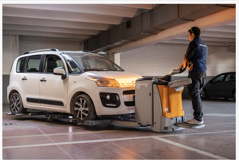
CarMoverXL moving a Vehicle inside a Garage

loading/unloading of vehicles while maintaining stability while moving an 8,000 lb. vehicle. These machines are custom manufactured order with choice of paint color, winch-size, and rubber tracks and available in two sizes. TowTrack, the smaller of the two can lift 8000 lbs. (requires a 26,000 GVW Rollback) and the TowTrackXL is the larger size that can lift 17,000 lb. (requires a 33K GVW Industrial-2-axle-Rollback Truck).