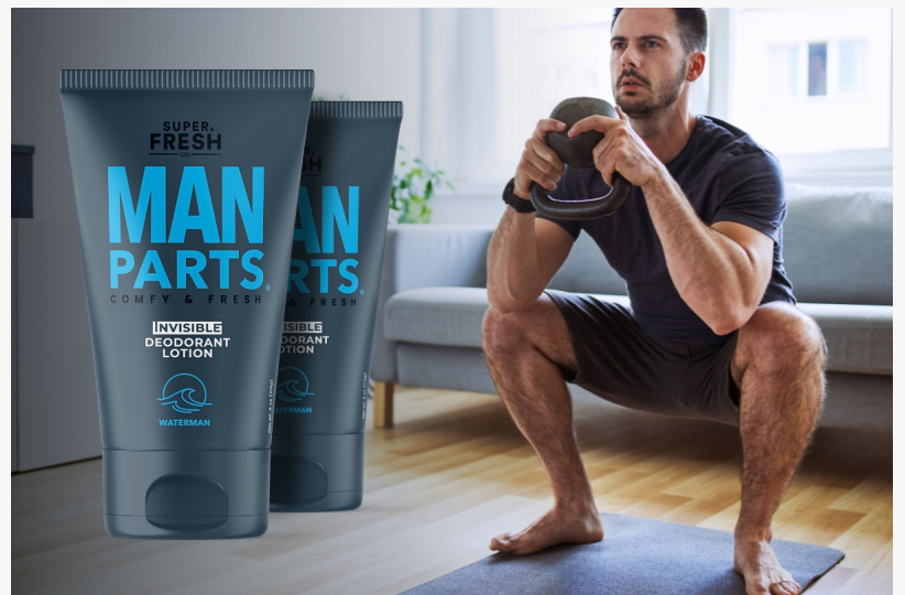
Super Fresh Man Parts Collection

This press release can be viewed online at: https://www.einpresswire.com/article/663564503