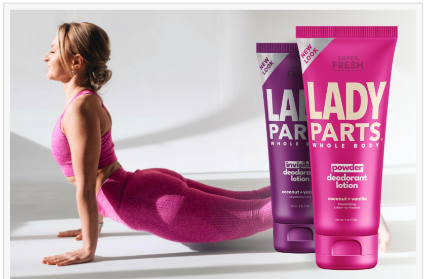
Super Fresh Lady Parts Collection

Sarah Limone Super & Fresh Co. media@superfresh.co