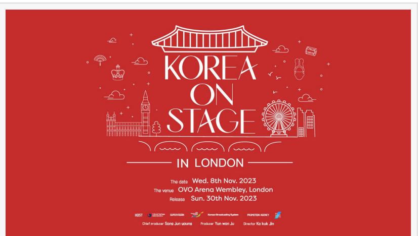
Korea On Stage - 8th November - OVO Arena Wembley London

At the exhibition, guests start by entering a virtual gate, guarded by a water gatekeeper. Beyond the gate, they encounter five heritage paintings reborn through AI technology, which has absorbed the painting styles of renowned British artists. Each piece gradually unfurls in a circular formation, a visually captivating representation of Korean cultural heritage.