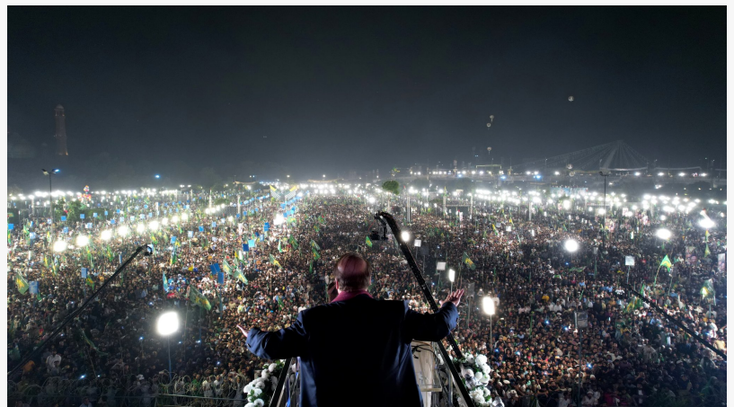
Lahore: Millions of People Gathered to Welcome Their Leader Nawaz Sharif

LAHORE, PUNJAB, PAKISTAN, October 25, 2023 /EINPresswire.com/ -- In an outpouring of popular support, millions gathered at Minar e Pakistan, the historic venue of gathering, to welcome home former Prime Minister Nawaz Sharif after 4 years of exile in London. Sharif, the only 3-time elected Prime Minister in Pakistan's history, left the country in 2019 under politically motivated fake cases, in which he got acquittal after due proceedings.