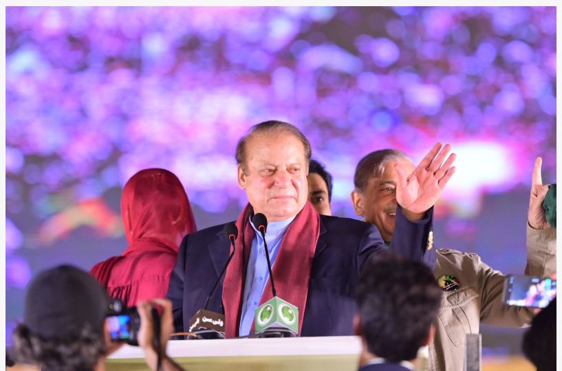
Nawaz Sharif Waves at Historic Gathering to Welcome Him

With his comeback, Sharif aims to galvanize the opposition and position himself as the leader Pakistan needs to regain lost promise. Given his track record of bold ideas and focus on