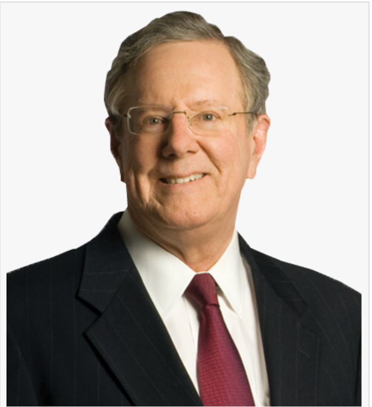
Steve Forbes will meet with the public in Nashville on October 27, 2023 at the International Money Expo.