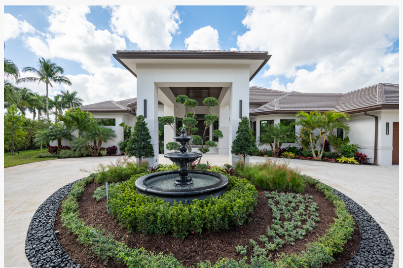
Fort Lauderdale General Contractor

In light of these challenges, Thomas Homes, known for being one of the top Fort Lauderdale general contractor, is committed to working closely with homeowners, industry stakeholders, and local authorities to find sustainable solutions for mitigating the rising home insurance costs in the area.