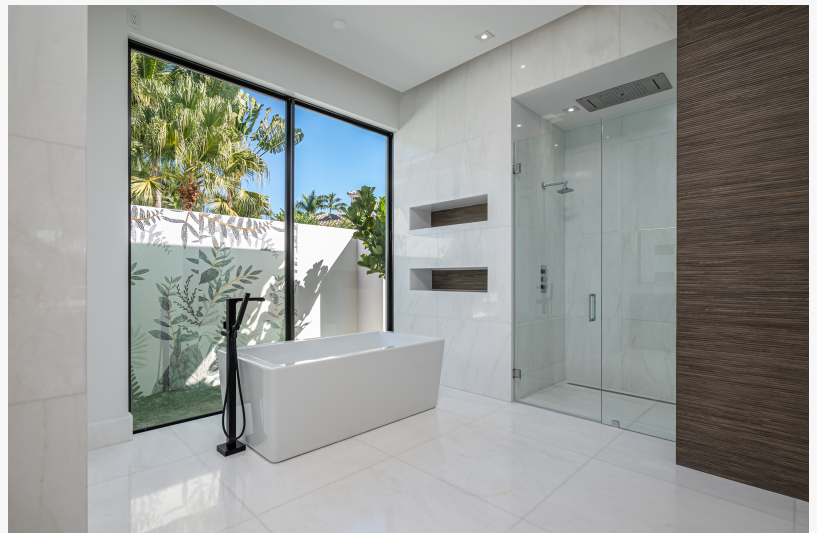
General Contractor Fort Lauderdale