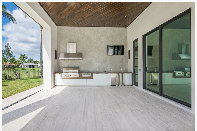
General Contractor Broward