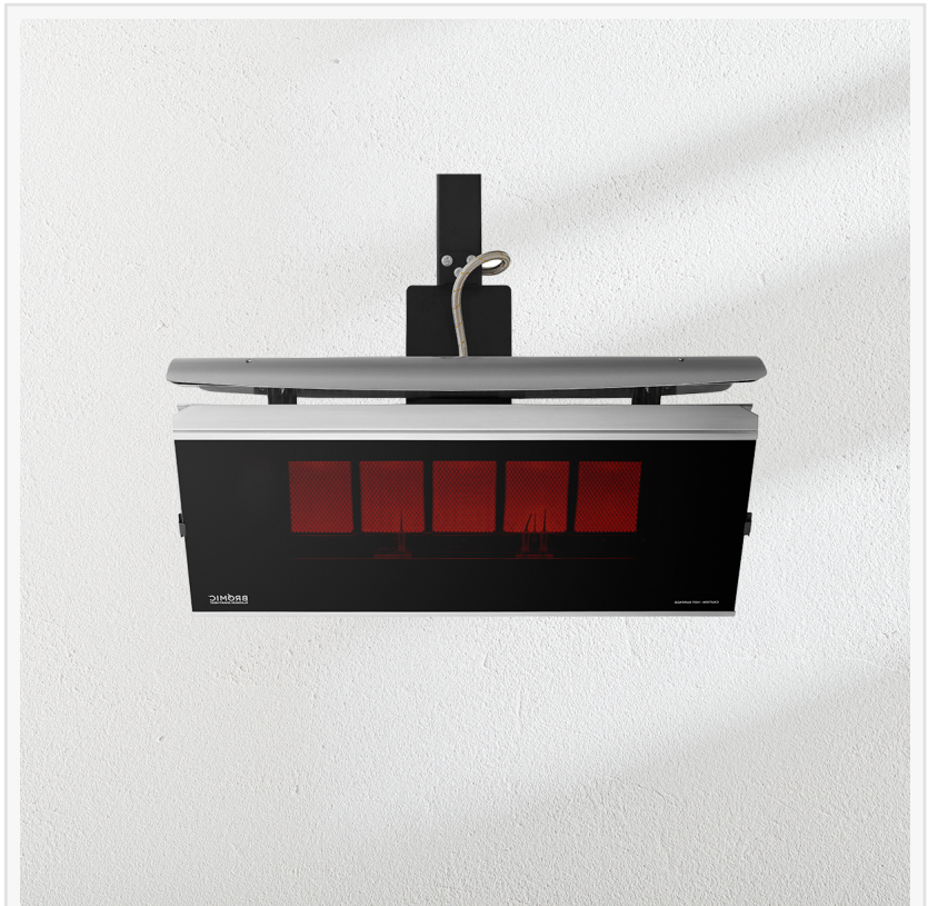
The Bromic Experience

Featuring a diverse selection of over 40 authentic styles, Real Fyre gas logs offer the perfect choice to enhance indoor spaces, including two