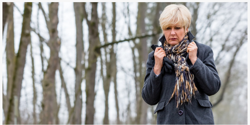
Problem drinking is an increasing problem among senior women.

But how can luxury rehab help with senior drug addiction? Luxury rehab is a great choice for seniors for several reasons. By offering all the comforts and amenities you could ask for,